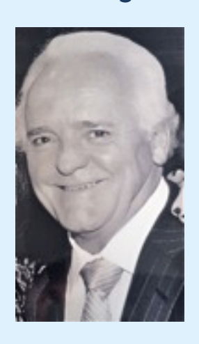
VETERANS DAY, 2014

As we remember and honor our Veterans on this Veterans Day, let us be reminded that the members of the Sons of the American Revolution are the direct and documented descendants of the very first American Veterans. Our fore fathers who fought and died for the freedom we have today.